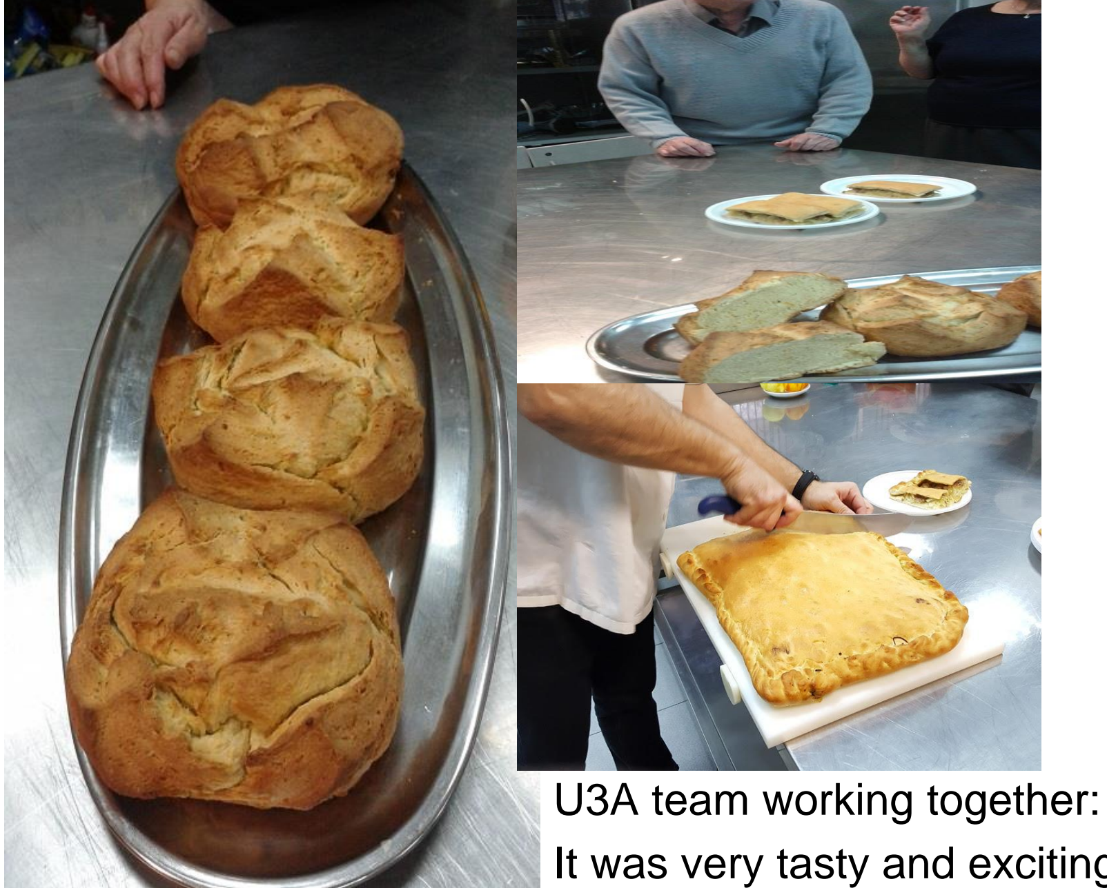
It was very tasty and exciting...