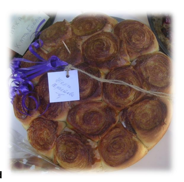
The festival became a sustainable source for support of the local livelihood